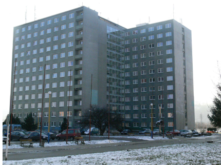
Halls of Residence

University of Presov offers accommodation for international students in Halls of Residence in Presov on 17th November Street, No. 11.